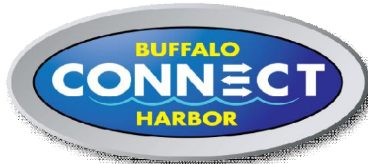
Figure 3 – Project Logo

5.3.1. Project Branding – Project branding has been developed and will continue to be utilized to give this project a unique identification throughout the community. A project logo has been developed for this purpose as shown below in Figure 3. This logo will be used on the project website, project advertisements, project correspondence, reports, handouts and graphics.